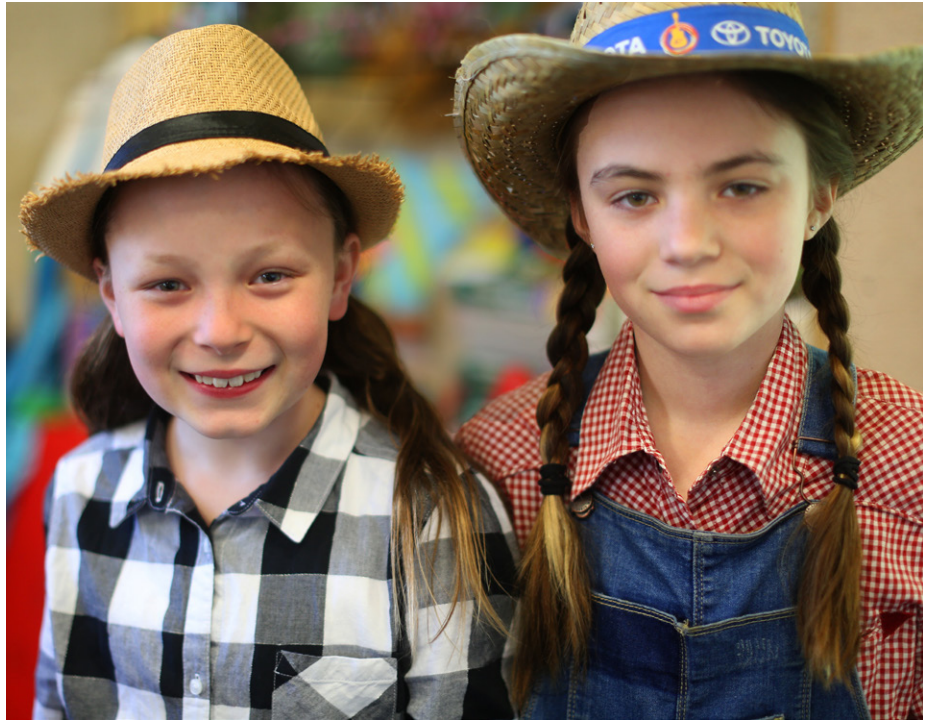
ABOVE: Monday September 9 was Fruit & Veggie dress up day.